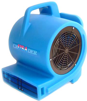
3500B Shown above in standard operating position for drying floors

The 3500 series airmovers from Crusader are great for speed drying both wet carpets and hard floors. Use to prevent a fall on a wet floor. They are affordable, powerful, compact units designed to move large volumes of air. They are ideal for ventilation.