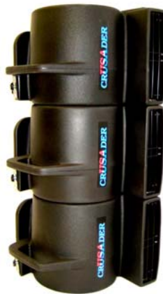
3 of the 3500 Series Airmovers shown stacked for storage