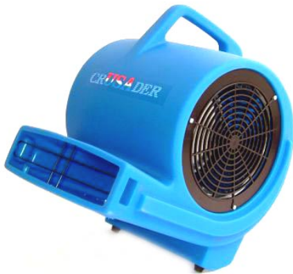
45° For walls and furniture or ventilation