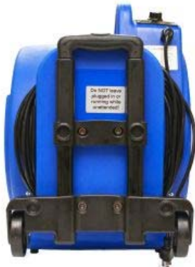
3500B Shown above with optional Telescopic Handle & Wheel Kit

Crusader Mfg., Inc. 517 First Street Farmington, MN 55024 (651) 456-9100 • Fax: (651) 456-9191 (800) 597-3336 • Fax: (800) 998-7311