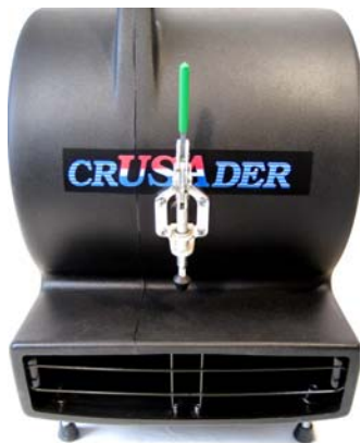
Shown with Optional #2424 Carpet Clamp and Standard Adjustable Front Legs