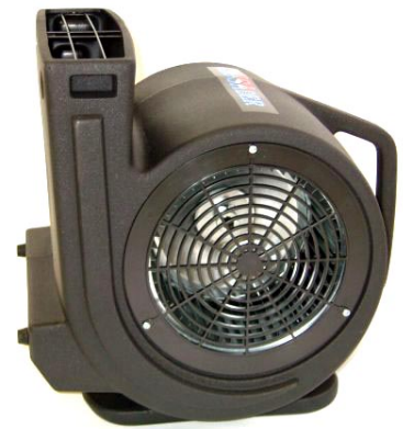
90° For ceilings and ventilation