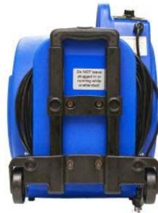
Shown with Optional #2425 Telescopic Handle & Wheel Kit